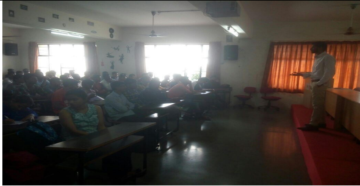
Students Attended Webinar in Seminar Hall (D102)